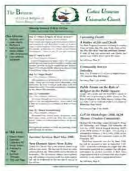
This format was used from 2004 - 2005