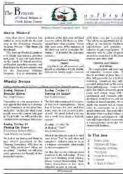
This format was used from 2003 - 2004