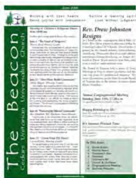
This format was used from 2006 - 2007