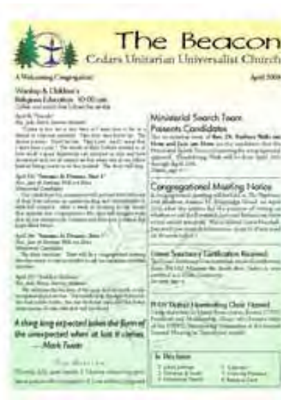
This format was used during 2008