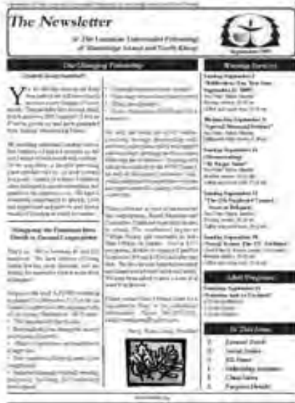
This format was used from 2001 - 2003