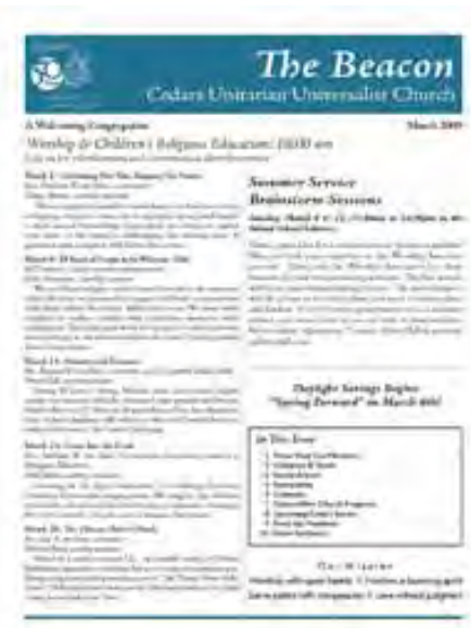
This format was used for our 50th anniversary year 2009-2010