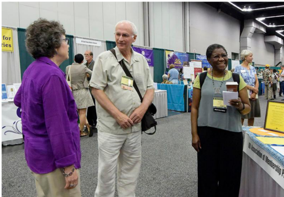
Cedars members meeting in the 2015 Portland GA exhibit hall.