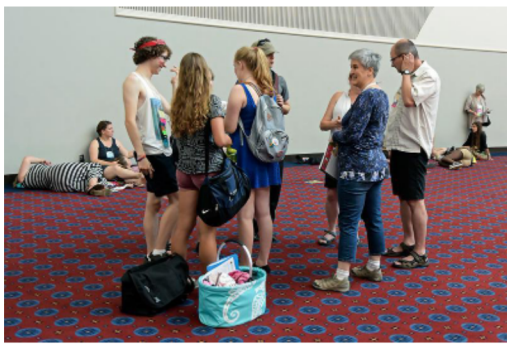
Cedars youth gathering at 2015 Portland GA