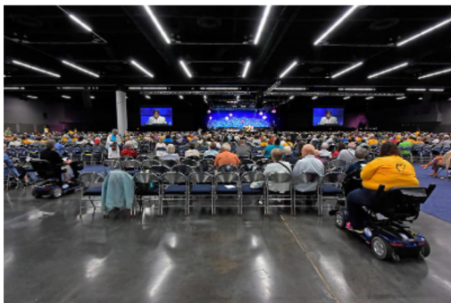
2015 Portland GA Worship service.

There will be time for conversation following the service during our virtual coffee hour. To access this please use this link .