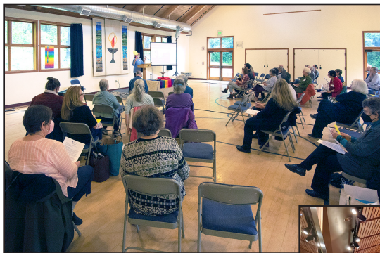
Worship with Open Hearts

In 2003, Cedars developed a simple mission statement that continues to this day to provide a “compass” to guide our efforts to build the beloved community we aspire to be.