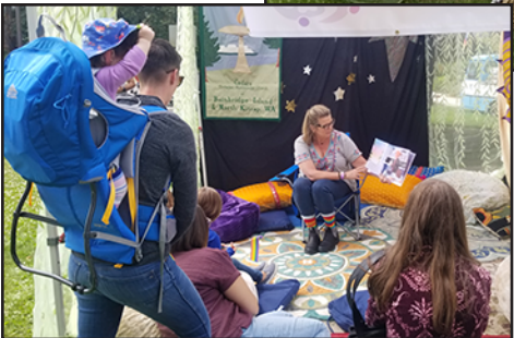
Serve Justice with Compassion